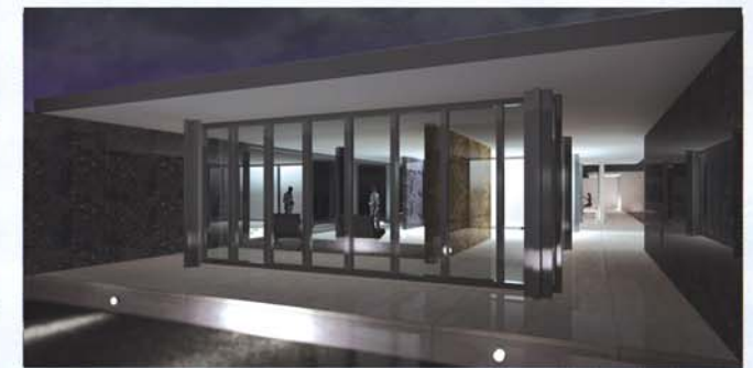
The Barcelona Pavilion shows how to define space through light.